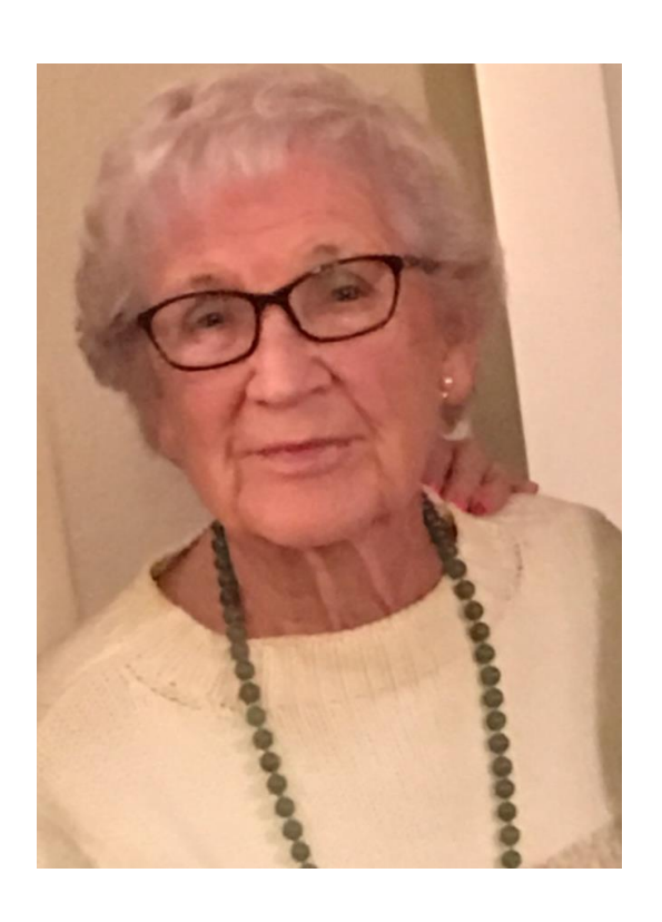
February 11, 2023 11:00 A.M.